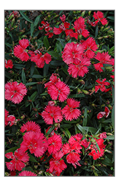
Telstar Coral Pinks flowers

An exceptional garden performer, this variety blooms early in the season and right up to the first frosts; bright green leaves contrast well with the amazing, frilly coral blooms; an excellent choice for rock gardens and edging