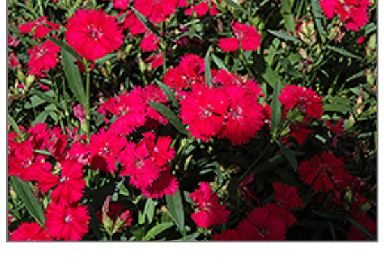
Telstar Carmine Rose Pinks flowers

An exceptional garden performer, this variety blooms early in the season and right up to the first frosts; bright green leaves contrast well with the amazing, frilly carmine red blooms; an excellent choice for rock gardens and edging