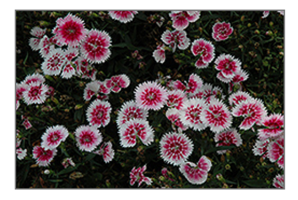
Ideal Select Whitefire Pinks flowers

Ideal Select Whitefire Pinks is recommended for the following landscape applications;