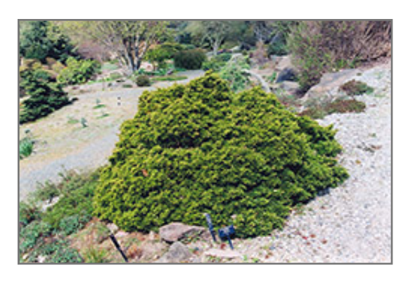
Globe Redcedar

Globe Redcedar will grow to be about 8 feet tall at maturity, with a spread of 8 feet. It tends to fill out right to the ground and therefore doesn't necessarily require facer plants in front, and is suitable for planting under power lines. It grows at a medium rate, and under ideal conditions can be expected to live for 70 years or more.