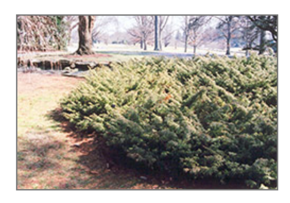
Prostrate Common Juniper

A broadly arching attractive evergreen groundcover shrub with sharp green needles all season long, good winter color; extremely adaptable to poor soils and dry locations, very hardy; makes an excellent massed groundcover