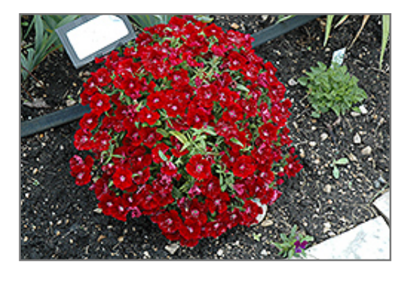
Floral Lace Crimson Pinks in bloom