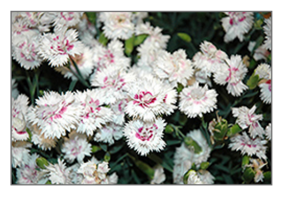
EverLast White plus Eye Pinks flowers