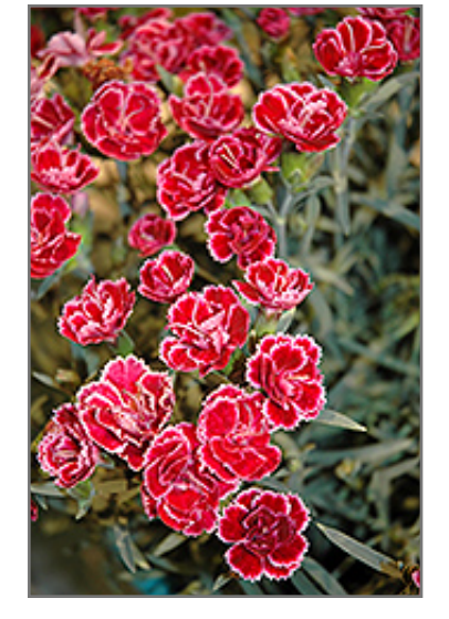
EverLast Burgundy Blush Pinks flowers

Breathtaking frilly double flowers are burgundy-red with white edges, above a compact mound of fine gray-green foliage; deadhead to rebloom; pair up with summer blooming perennials and annuals to time a continued flower display