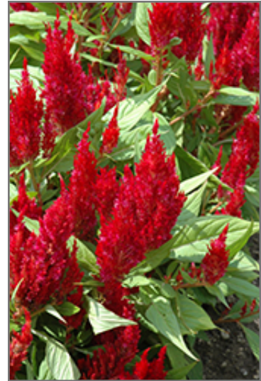
First Flame Red Celosia flowers

First Flame Red Celosia is recommended for the following landscape applications;