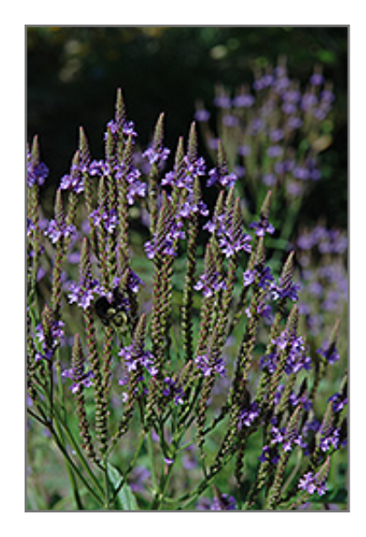
Blue Verbena flowers

Blue Verbena is recommended for the following landscape applications;