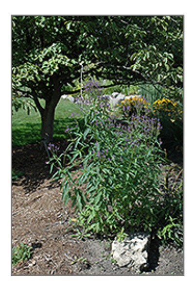
Blue Verbena in bloom