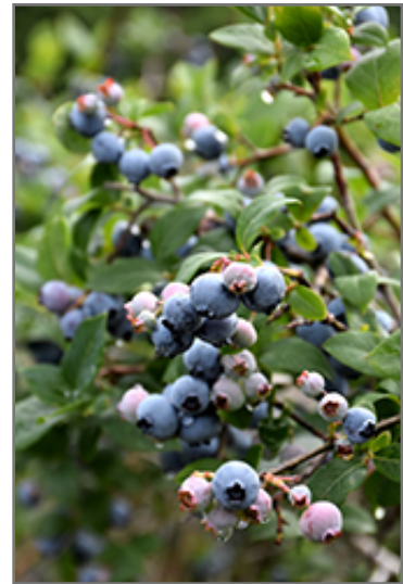
Blue Jay Blueberry fruit