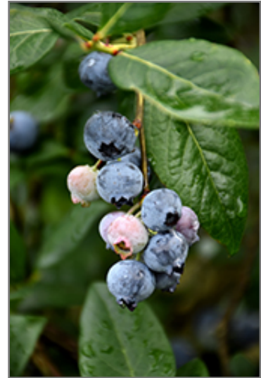
Blue Jay Blueberry fruit

This shrub is typically grown in a designated area of the yard because of its mature size and spread. It does best in full sun to partial shade. It does best in average to evenly moist conditions, but will not tolerate standing water. It is very fussy about its soil conditions and must have sandy, acidic soils to ensure success, and is subject to chlorosis (yellowing) of the foliage in alkaline soils. It is quite intolerant of urban pollution, therefore inner city or urban streetside plantings are best avoided, and will benefit from being planted in a relatively sheltered location. Consider applying a thick mulch around the root zone in winter to protect it in exposed locations or colder microclimates. This is a selection of a native North American species.