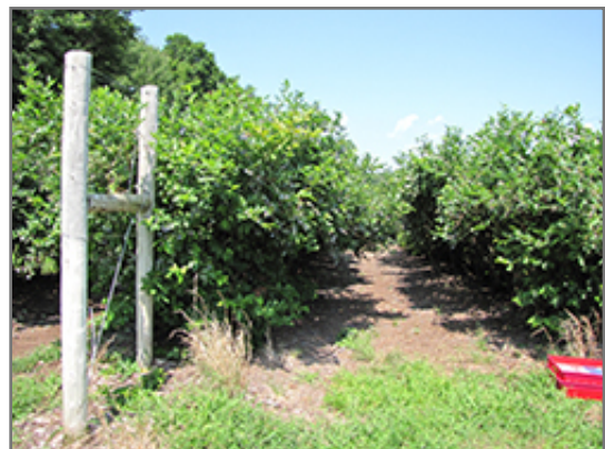
Blue Jay Blueberry fruit