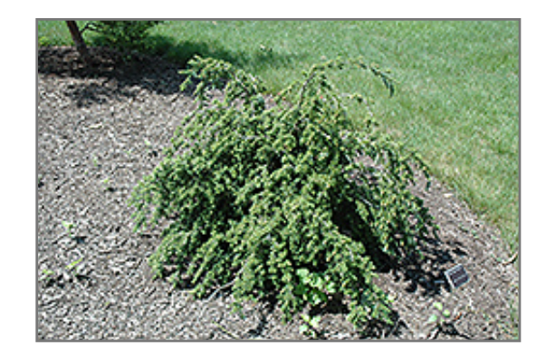
Gracilis Japanese Hemlock

This dwarf cultivar is compact, round and dense when young, then develops a more irregular habit when mature; very short needles gives this variety a fine texture; likes sunshine and acidic moist soil