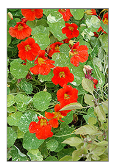
Alaska Nasturtium flowers

A bushy, spreading variety with interesting dark green foliage with white variegation; blooms range in color with shades of cream, yellow, orange, salmon, and burgundy; great as an annual in mixed beds, containers or borders