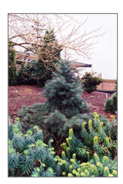
Weeping White Fir

The Weeping White Fir will grow to be about 10 feet tall at maturity, with a spread of 8 feet. It tends to fill out right to the ground and therefore doesn't necessarily require facer plants in front, and is suitable for planting under power lines. It grows at a slow rate, and under ideal conditions can be expected to live for 80 years or more.