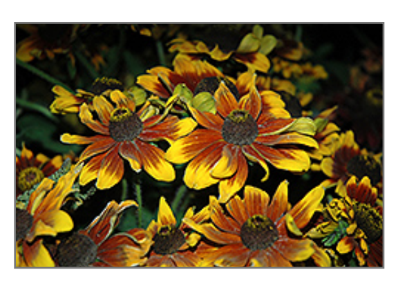
Chocolate Orange Coneflower flowers

A beautiful color variety with flowers that put on a dazzling show with chocolate-maroon centers around golden-orange edges; long lasting flowers all summer and is the perfect fit for any garden; excellent for containers as well