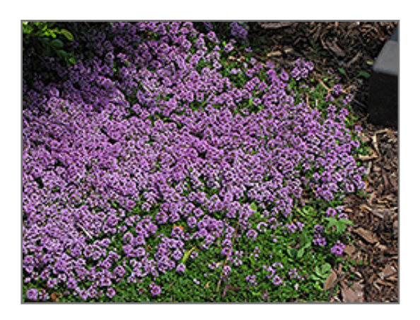
Purple Carpet Creeping Thyme in bloom