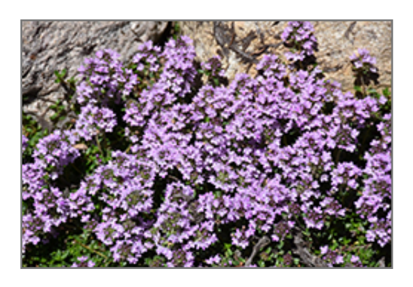
Purple Carpet Creeping Thyme flowers

This plant will require occasional maintenance and upkeep, and is best cleaned up in early spring before it resumes active growth for the season. Deer don't particularly care for this plant and will usually leave it alone in favor of tastier treats. Gardeners should be aware of the following characteristic(s) that may warrant special consideration;