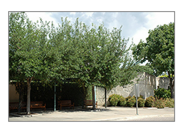
Highrise Live Oak