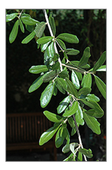
Highrise Live Oak foliage