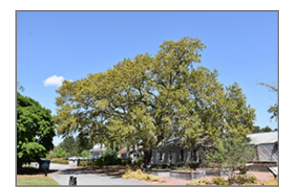
Southern Live Oak