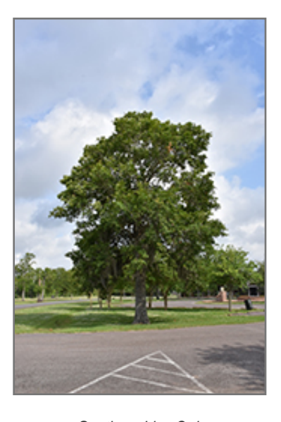
Southern Live Oak