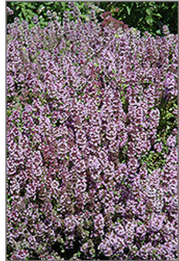
Mother-of-Thyme in bloom

This plant will require occasional maintenance and upkeep, and is best cleaned up in early spring before it resumes active growth for the season. Deer don't particularly care for this plant and will usually leave it alone in favor of tastier treats. Gardeners should be aware of the following characteristic(s) that may warrant special consideration;