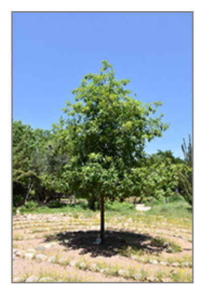
Monterrey Oak

This tree will require occasional maintenance and upkeep, and is best pruned in late winter once the threat of extreme cold has passed. It is a good choice for attracting birds and squirrels to your yard. Gardeners should be aware of the following characteristic(s) that may warrant special consideration;