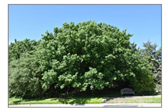
Monterrey Oak