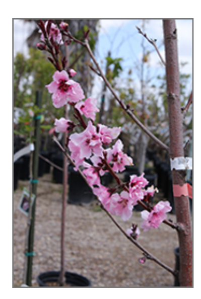
Spicezee Nectaplum flowers

Spicezee Nectaplum is draped in stunning clusters of fragrant pink flowers along the branches in early spring before the leaves. It has dark green deciduous foliage which emerges red in spring. The narrow leaves turn yellow in fall. The fruits are showy dark red drupes with shell pink overtones, which are carried in abundance in mid summer. The fruit can be messy if allowed to drop on the lawn or walkways, and may require occasional clean-up.