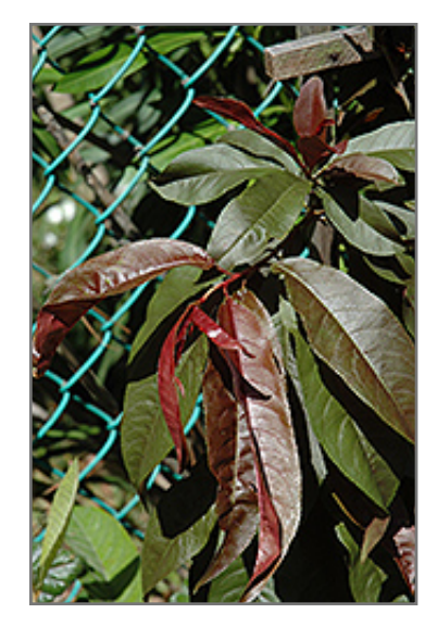
Spicezee Nectaplum foliage