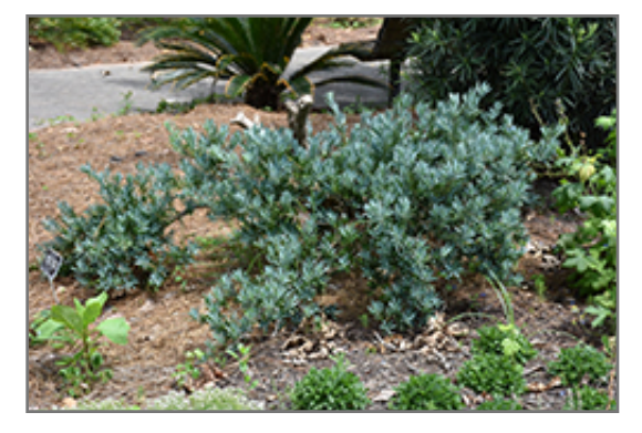
Icee Blue Yellowwood

Icee Blue Yellowwood will grow to be about 30 feet tall at maturity, with a spread of 30 feet. It has a low canopy with a typical clearance of 1 foot from the ground, and should not be planted underneath power lines. It grows at a slow rate, and under ideal conditions can be expected to live for 50 years or more.