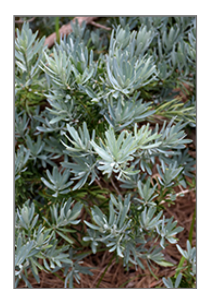
Icee Blue Yellowwood foliage