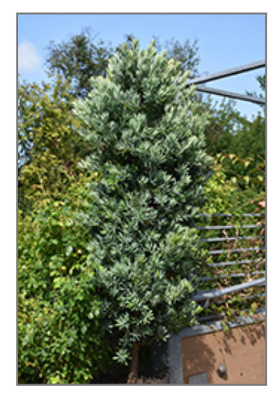
Icee Blue Yellowwood

Icee Blue Yellowwood is recommended for the following landscape applications;