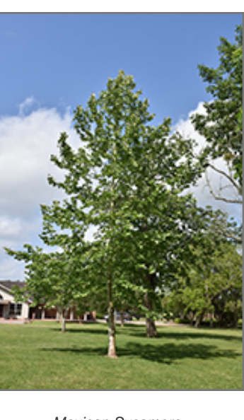
Mexican Sycamore

This tree will require occasional maintenance and upkeep, and is best pruned in late winter once the threat of extreme cold has passed. It is a good choice for attracting squirrels to your yard, but is not particularly attractive to deer who tend to leave it alone in favor of tastier treats. It has no significant negative characteristics.