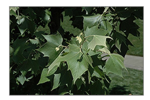
Mexican Sycamore foliage

Mexican Sycamore is recommended for the following landscape applications;