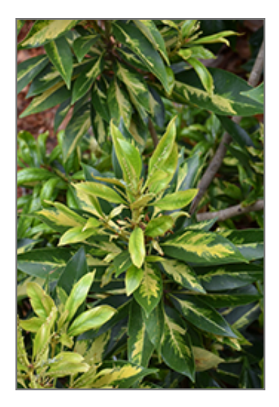
Variegated Japanese Tanbark Oak foliage