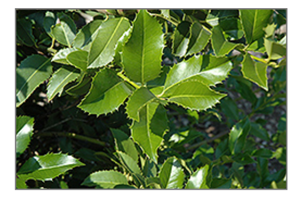
Wirt L. Winn Holly foliage

Lustrous dark green, evergreen foliage with spiny edges; brilliant scarlet fruit adds color to the fall and winter landscape; does best in evenly moist, acidic soil, an excellent screening plant