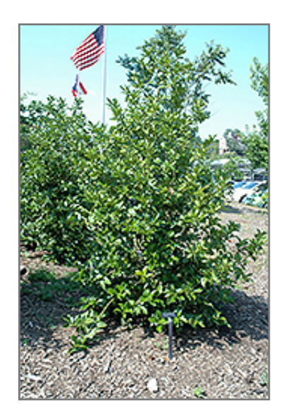
Wirt L. Winn Holly

Wirt L. Winn Holly is recommended for the following landscape applications;