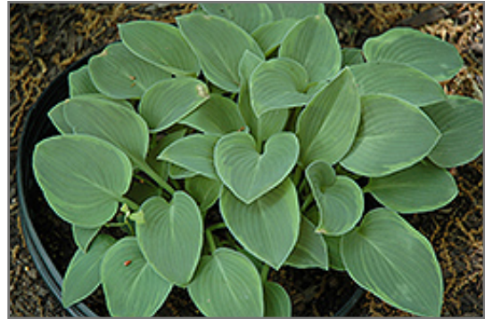
Toy Soldier Hosta