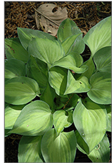
Tick Tock Hosta foliage

This variety forms a nice mound of gold foliage with blue-green margins; pale lavender flowers in early summer; perfect for shade and woodland gardens