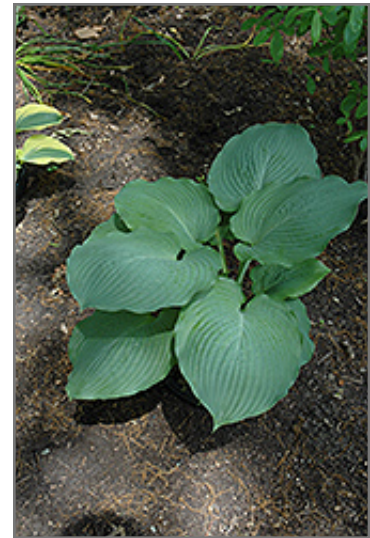
Thunder Boomer Hosta

This one has broad, pointed leaves of blue-green, that arch gently and have lightly waving edges; pale lavender flowers on stout scapes in mid-summer; perfect for shade and woodland gardens