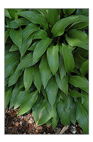
Temple Bells Hosta foliage

This variety features a mound of flat, lance shaped, dark green leaves layered horizontally; purple flowers on arching scapes in mid-summer; perfect for shade and woodland gardens