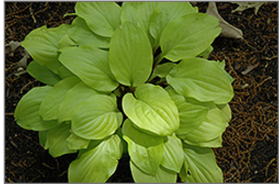
Strawberry Banana Smoothie Hosta