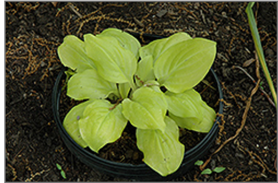
Smiley Face Hosta