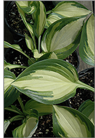
Rare Breed Hosta foliage