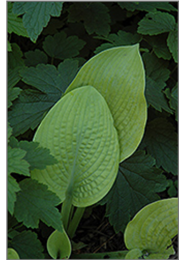
Pretty Peggy Hosta foliage

A medium sized upright clump of golden foliage that is corrugated, wavy, and of good substance; near-white flowers on arching stems in early summer; perfect for shade and woodland gardens