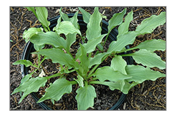
Outhouse Delight Hosta