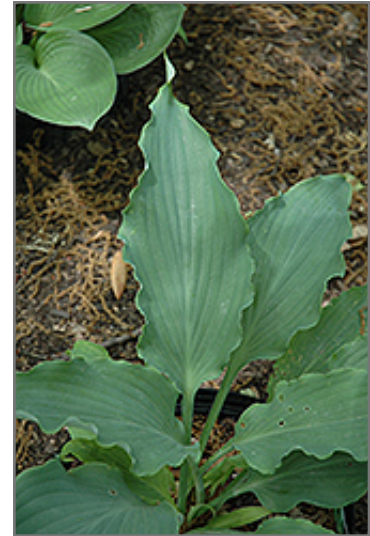
Neptune Hosta foliage