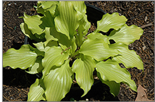
Nancy Hosta