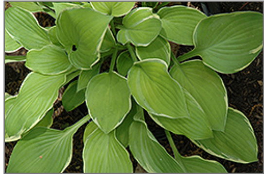
Moonlight Hosta foliage