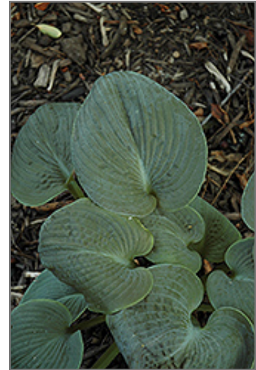
Mood Indigo Hosta foliage