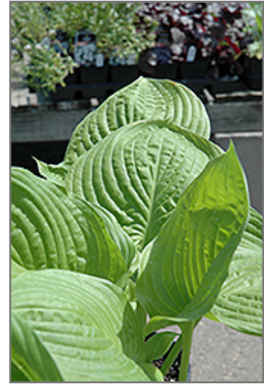
Mayflower Moon Hosta foliage