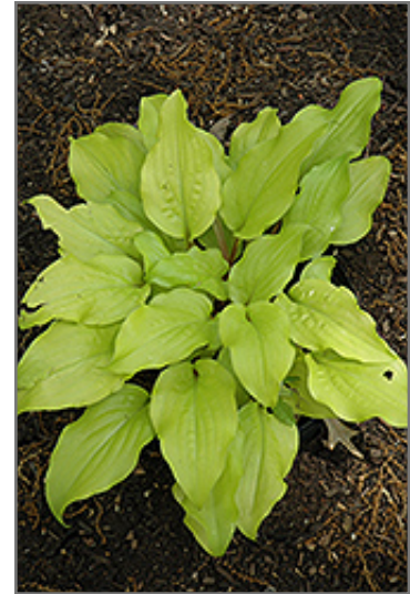
Mango Salsa Hosta