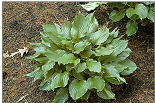
Lakeside Coal Miner Hosta