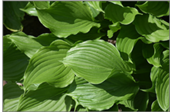
Lakeside Coal Miner Hosta foliage

Lakeside Coal Miner Hosta is recommended for the following landscape applications;