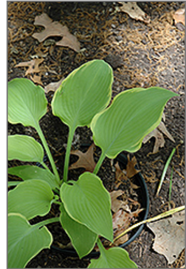
Lakeside Cha Cha Hosta foliage

Lakeside Cha Cha Hosta is recommended for the following landscape applications;