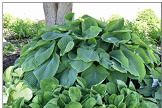
Komodo Dragon Hosta