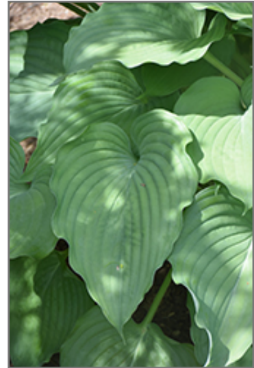
Komodo Dragon Hosta foliage