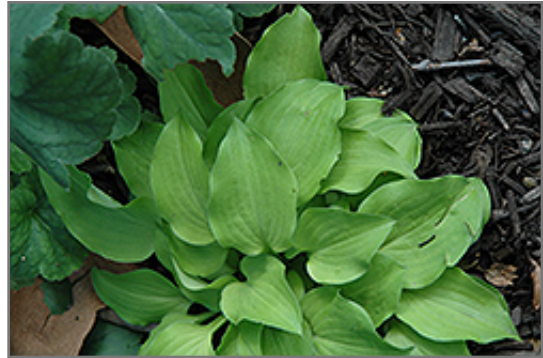
Jiminy Cricket Hosta foliage