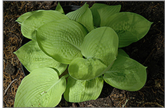
Jewel Of The Nile Hosta