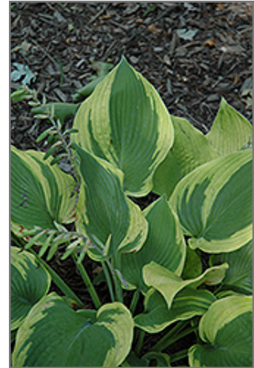
Handy Hatfield Hosta foliage