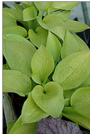
Golden Prayers Hosta foliage