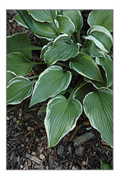
Emma Hosta foliage

A dark green leaf center with striking, thin white margins and light blue variegation; leaf is heart shaped and nicely ridged; spikes of pale lavender flowers in mid-summer; a stunning specimen in the garden or border