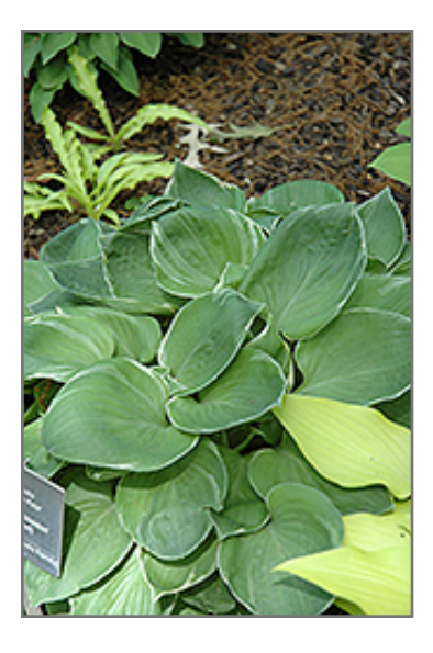
Dixie Pixie Hosta foliage

A smaller, low variety producing lightly cupped and rippled blue-green leaves with a thin white edge; spikes of pale lavender flowers in mid-summer; a lovely addition to the garden or border