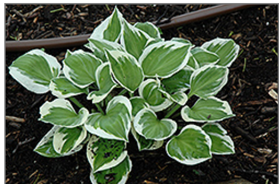
Diamonds Are Forever Hosta