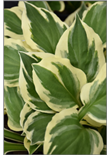
Diamonds Are Forever Hosta foliage

Diamonds Are Forever Hosta is recommended for the following landscape applications;